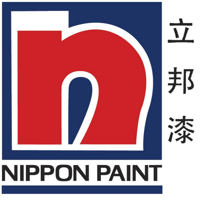
Nippon Paint China is Asia's largest paint and coatings manufacturer.