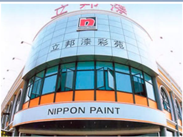
One of Nippon Paint's 300 stores across China that will feature Autech's award-winning software