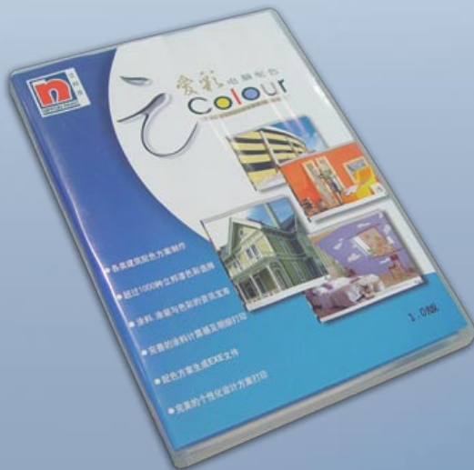
Autech was the first Tasmanian company to export software to China with the Nippon Paint i-colour program in 2002.